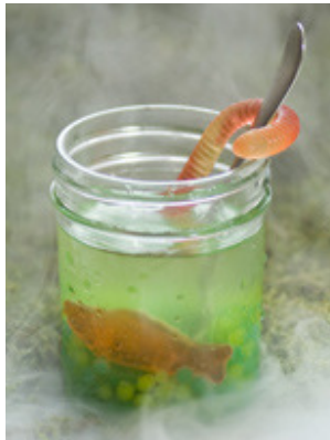
Filled with gummy creatures and fish eggs made from tapioca pearls, this sweet, bubbly drink looks like something scooped up from a deep, dark bog. Try making a batch for a Halloween gathering or a spooky after-dinner treat!

oca pearls, this sweet, bubbly drink looks like something scooped up from a deep, dark bog. Try making a batch for a Halloween gathering or a spooky after-dinner treat!